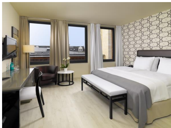
Deluxe Double Room

Our restaurant “Salt & Pepper” with a mix of delicate Mediterranean and international food, our bar at the lobby, our business center and an underground garage complete our offer. Our charming typical Berlin terrace is perfectly suited for smaller events.