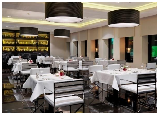
Restaurant „Salt & Pepper“

Our restaurant “Salt & Pepper” with a mix of delicate Mediterranean and international food, our bar at the lobby, our business center and an underground garage complete our offer. Our charming typical Berlin terrace is perfectly suited for smaller events.